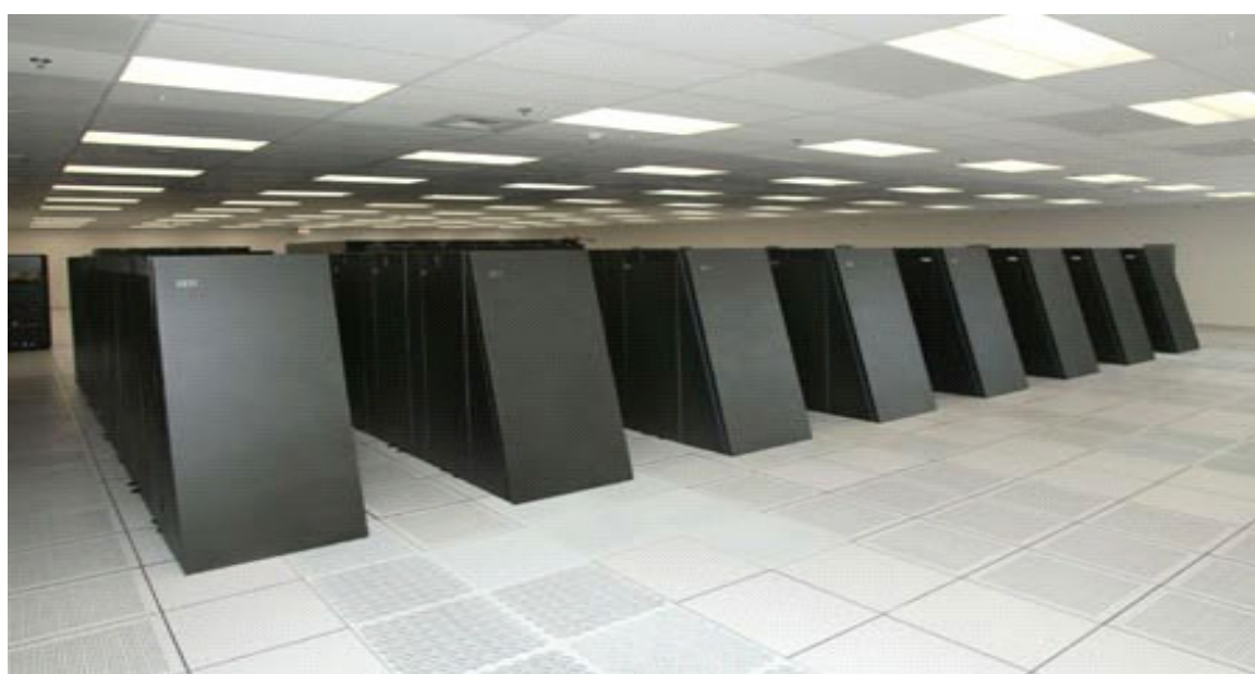
IBM Blue Gene/L: 370 Tflops