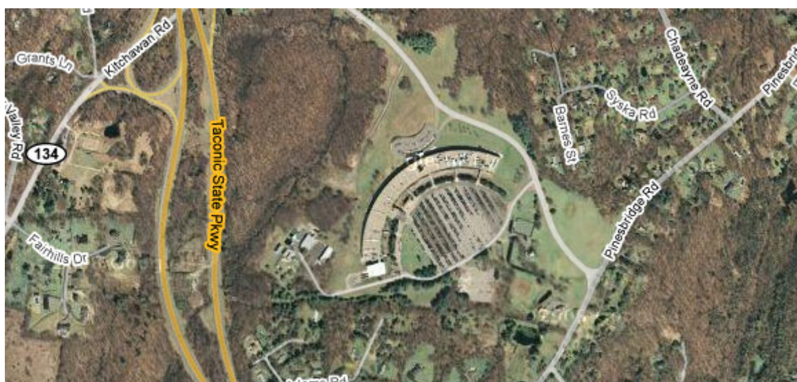
IBM T. J. Watson research, Yorktown Heights, místo pořádání konference

Konference se koná v centrálním výzkumném centru IBM Watson Research asi 40km severně od Manhattanu. Tento největší komerční výzkumný ústav na světě je mimo jiné známý tím, že je zde instalován nevykonnější superpočítač světa, IBM Blue Gene/L s výkonem 370Tflops. Účastnický poplatek činí pouze US$ 200. Průměrný počet účastníků konference 2500.